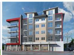
FORTUNE HILL SIDE Vamanjoor Bondel Road, Bondel