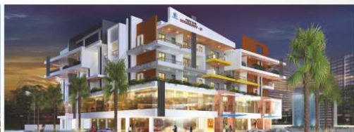
FORTUNE HIGHWAY-2 Moodbidri