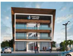
FORTUNE CENTER Bajagoli