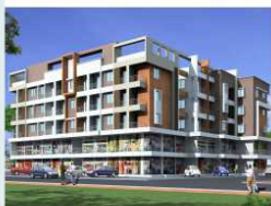
FORTUNE HIGHWAY Moodbidri