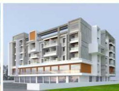
FORTUNE GALAXY Karkala