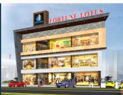
FORTUNE LOTUS Karkala