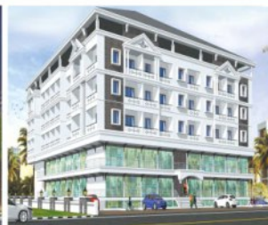
FORTUNE NEETHI HEIGHTS Moodbidri