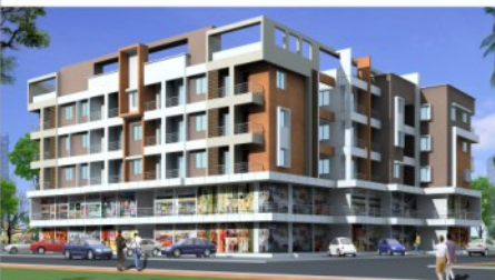
FORTUNE HIGHWAY Moodbidri