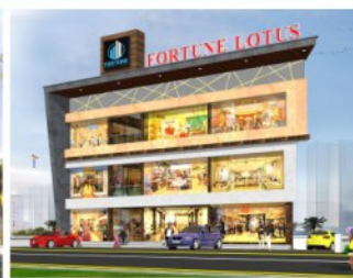
FORTUNE LOTUS Karkala