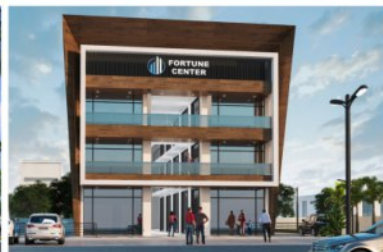
FORTUNE CENTER Bajagoli