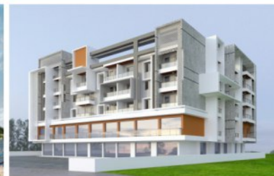
FORTUNE GALAXY Karkala