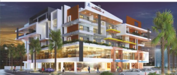
FORTUNE HIGHWAY-2 Moodbidri